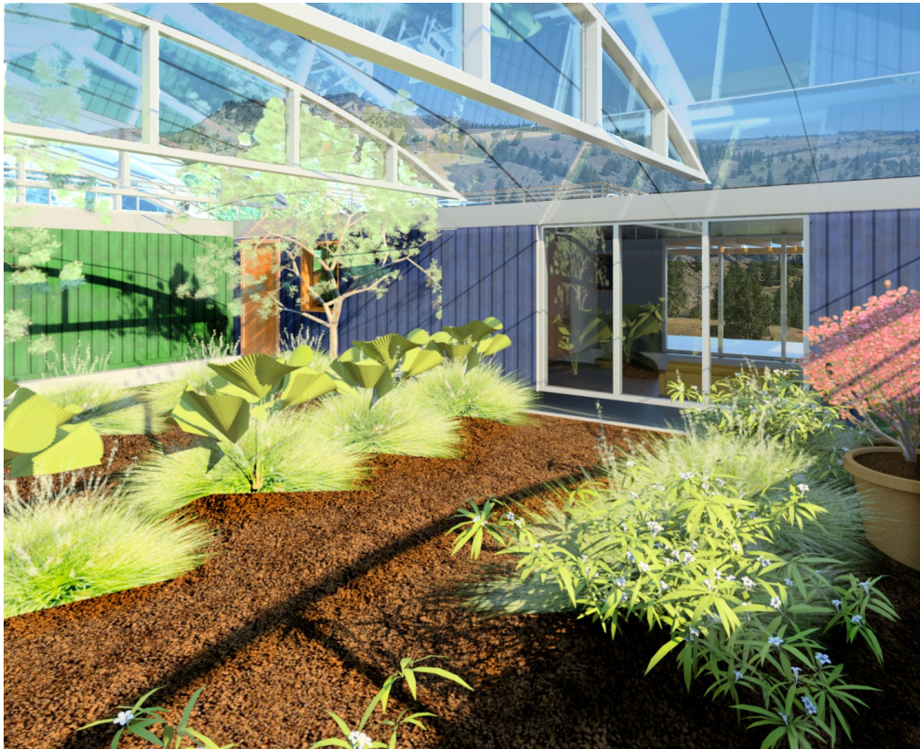
Freedom Home™ greenhouse rendering

Goal 3 is to begin construction of the first one to three Freedom Homes. The homes will share basic features such as living area, water treatment utility area, power production and storage area, heating systems for home and greenhouse, central greenhouse, water storage, food storage, work areas and other needful features. Various design layouts will be built to achieve a variety in home designs. The target cost for building the average home is roughly $150,000 each. The first three to five homes are expected to be over the target cost until the building process becomes streamlined.